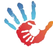
Hearsall Community Academy